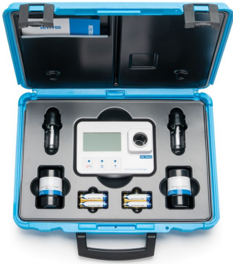
Fotómetro Portátil de Bajo Rango para Fluoruro con Maleta